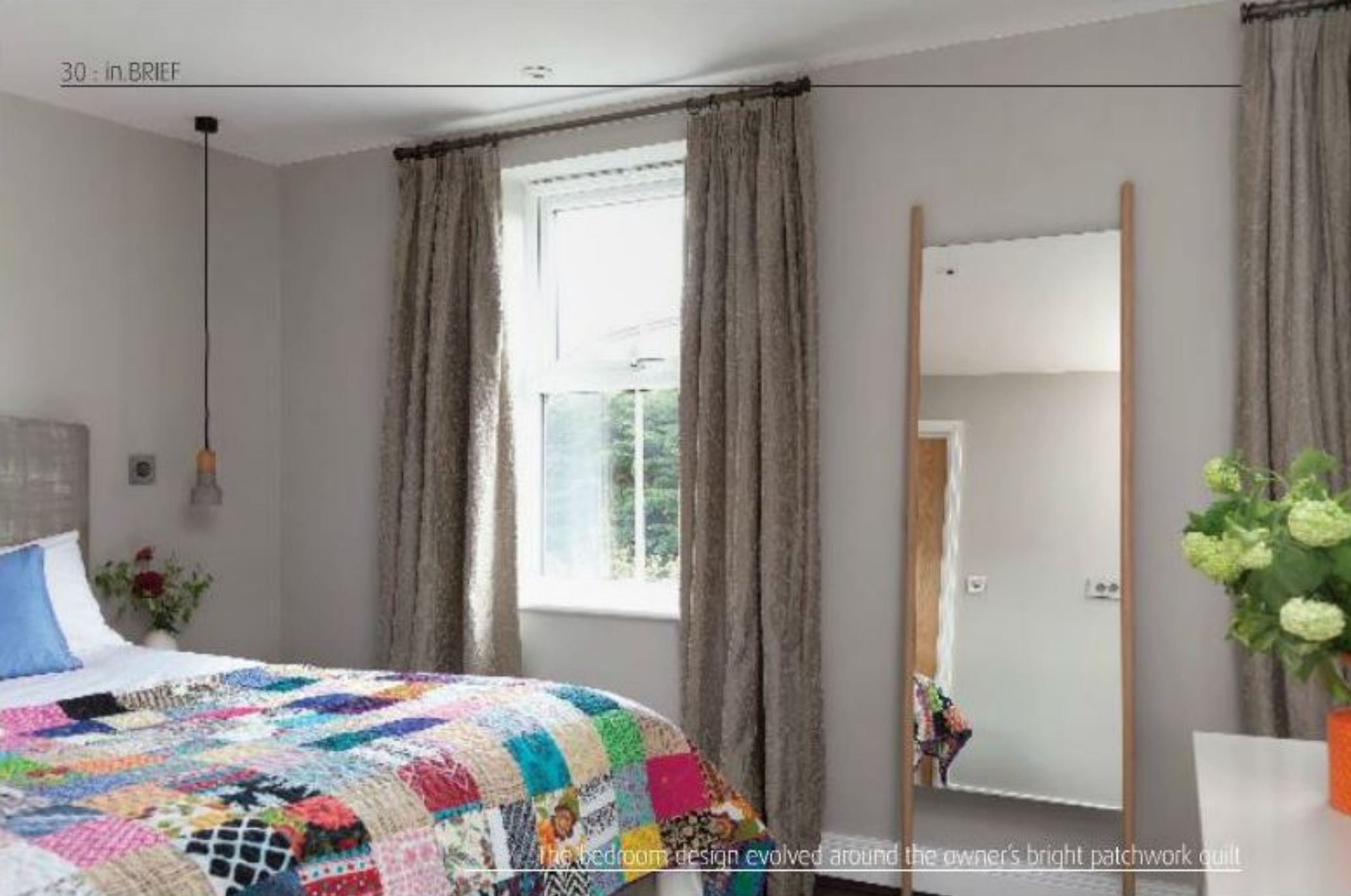
The bedroom design evolved around the owner's bright patchwork quilt

▲ Danish Boyesen Monkey is the perfect Scandinavian accessory and adds another fun element to the scheme.