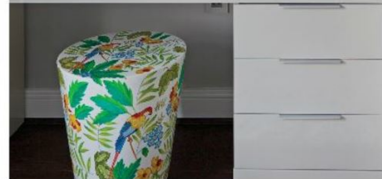
The dressing table is GoModern, with a hand-painted stool from Feather & Black