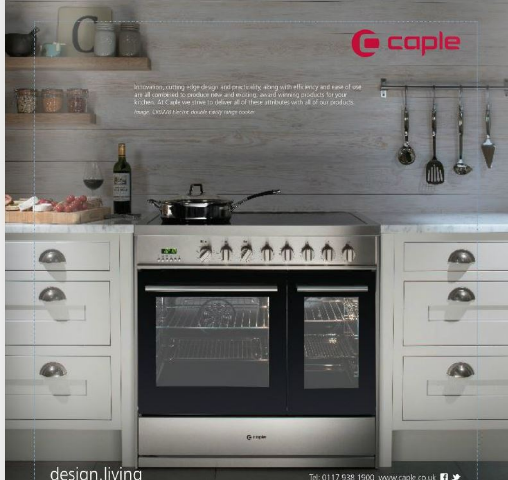
Image: CR9228 Electric double cavity range cooker

Innovation, cutting edge design and practicality, along with efficiency and ease of use are all combined to produce new and exciting, award winning products for your kitchen. At Caple we strive to deliver all of these attributes with all of our products.