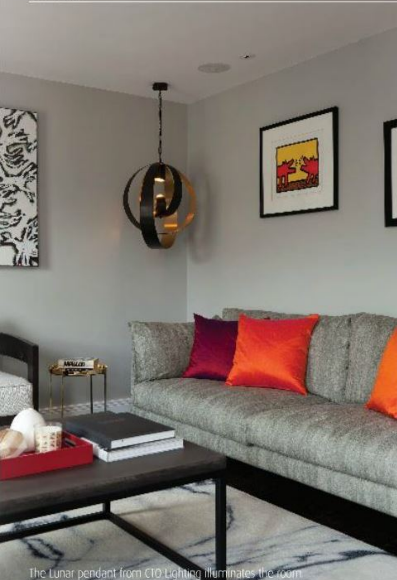
The Lunar pendant from CTO Lighting illuminates the room

▲ filled with the client's favourite books, family photographs and possessions, gives the living room a stylish personal and homely touch.